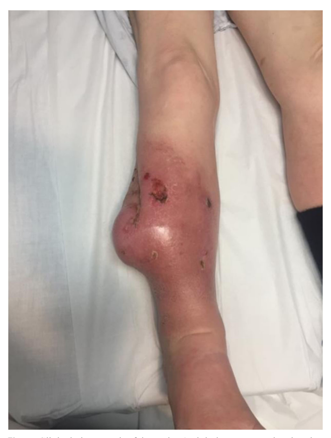
Fig. 1 Clinical photograph of the patient's right lower extremity showing severe soft-tissue swelling, erythema, and ulcerations. A surgical scar was noted

was clear evidence for osseous destruction of the fibular diaphysis.