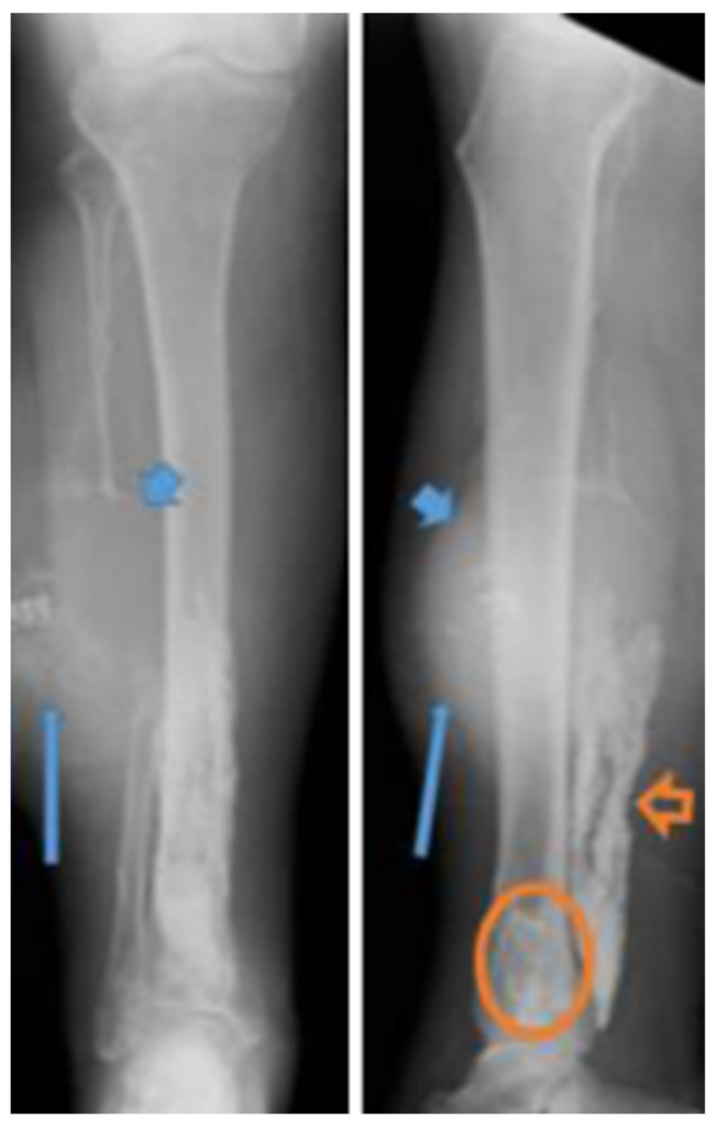
Fig. 2 a Anteroposterior and b lateral radiographs of the right tibia and fibula showing a large soft-tissue mass ( short arrow ) associated with destruction of the mid-fibular diaphysis. The mass contains mixed density, including an area of dense soft tissue and calcification ( long arrow ). The distal tibia contains a lesion with a serpiginous sclerotic border and lucent center, features of an osseous infarct ( circle ). Ossification posterior to the tibia is present with a zonal pattern reminiscent of myositis ossificans ( open arrows )

Given the concerning imaging findings, a decision was made to proceed with open biopsy of the lesion. Possible diagnoses included infection and malignancy. A longitudinal incision was made along the lateral aspect of the leg, over the area of greatest mass prominence. As soon as the deep fascia was entered, fluid under pressure was encountered. Exploration revealed fibers consistent with suture. Further inspection showed a large mass with necrotic and inflammatory tissue (Fig. 4). Removal of a portion of the mass led to the discovery of more cotton fibers consistent with a retained surgical sponge with radiopaque markings. Because of the amount of time that had elapsed, the sponge had disintegrated and the markings were uninterpretable on imaging. Frozen sections were taken from areas suspicious for tumor. All were negative, though low-power photomicrographs showed fibers (Fig. 5). The remaining mass was then removed piecemeal. Fibers that had extended into surrounding tissues were removed, if possible. Cultures were ordered, and intravenous antibiotics were administered. Cultures grew Alcaligenes faecalis, Staphylococcus aureus, and group B streptococcus. The patient was discharged several days later on a 6-week