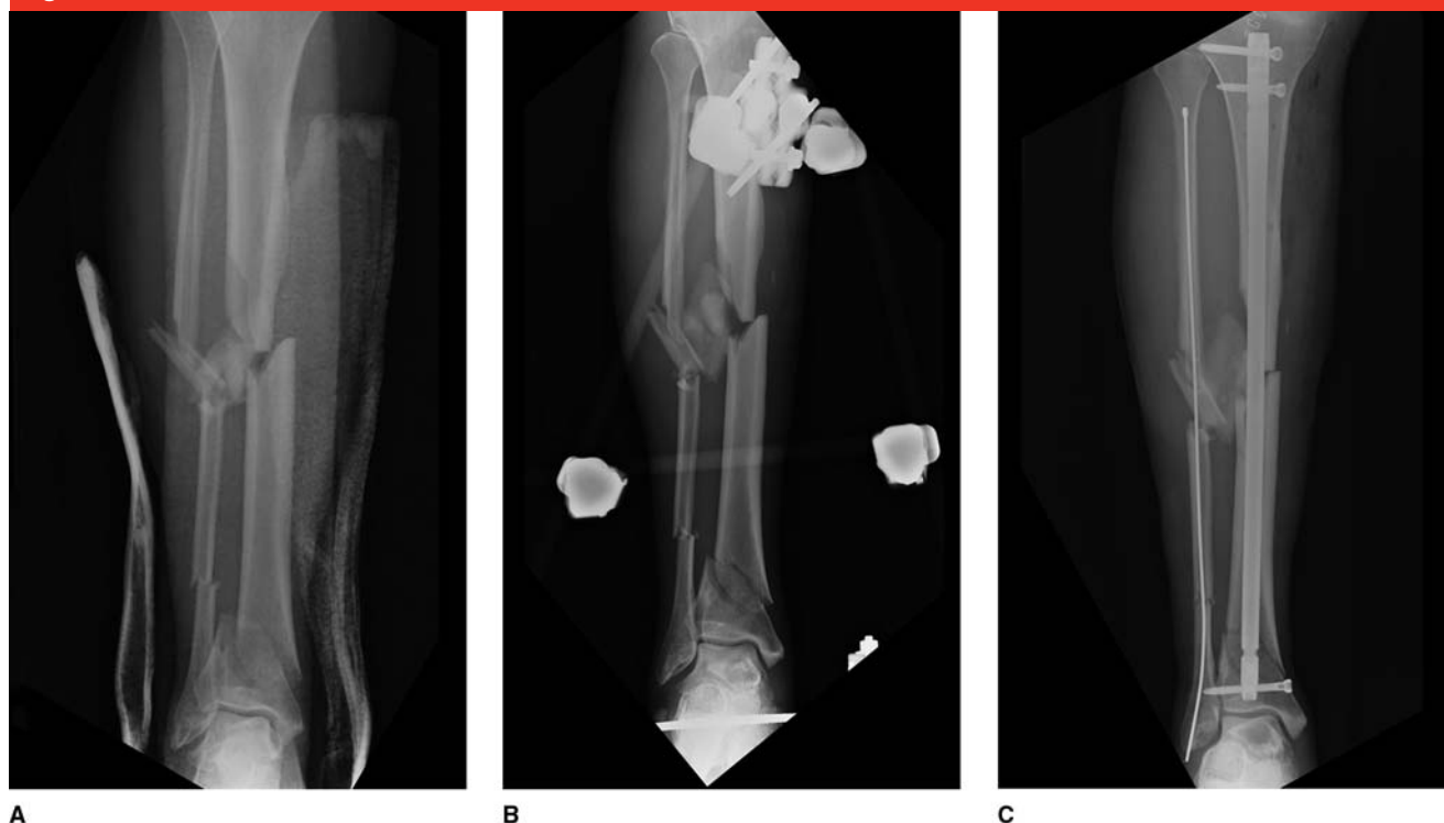
A , AP radiograph demonstrating open segmental tibial shaft fracture in a patient with bilateral lung injury, cervical spine injury, and a forearm fracture involving both bones. B , AP radiograph showing fracture stabilization with external fixation as part of a damage-control protocol. C , AP radiograph obtained after conversion from external fixation to an intramedullary nail with fixation of the fibula to provide added stability to the lateral soft tissue.

ployed a “safety interval” of casting or bracing between removal of the external fixator and IM nailing to allow granulation of pin sites. A recent meta-analysis of level III and IV studies identified nine studies (268 patients, 212 open fractures) that reported on planned conversion from external fixation to IM nailing for tibial shaft fractures. 20 Infection was reported in 9% of patients, and union was reported in 90% of fractures. Shorter duration of external fixation ( \leq 28 days) resulted in a significantly reduced rate of infection than with longer external fixation ( >28 days) (3.7% versus 22%, respectively). However, contrary to previous reports, an interval of <14 days between removal of the external fixator and IM nailing was associated with a significant reduction in