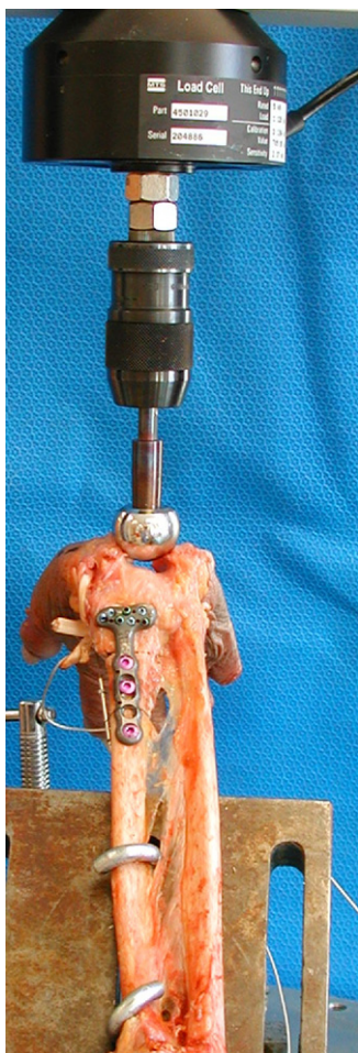
FIGURE 2: Test setup showing specimen with locking plate in place and the extension load applied.

shaft. We used the DVRTs to measure the relative motion between bone segments (Fig. 1).